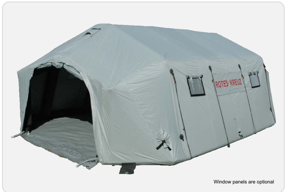
Window panels are optional