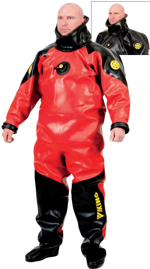
VIKING™ HD with SL27 yoke (inset shows black suit with SL27 yoke).

The VIKING™ HD is considered to be the industry standard for commercial diving worldwide. The suit material is as it suggests, heavy duty, built to withstand the rigours of diving in a harsh working environment. Whether the job is cleaning a ships hull, carrying out welding and inspection, or clearing a fouled propeller, the VIKING™ HD is equal to these tasks and more.