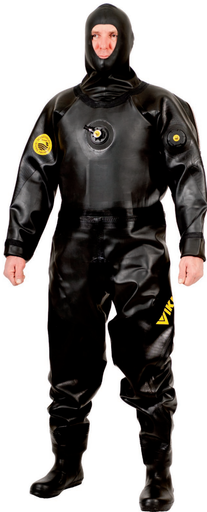
VIKING™ PROTECH with Surveyor latex hood.

Flexible drysuit designed for maximum comfort in a wide range of applications, particularly suited to military use. Rear entry design. Vulcanised seams allow for peace of mind when diving under all situations.