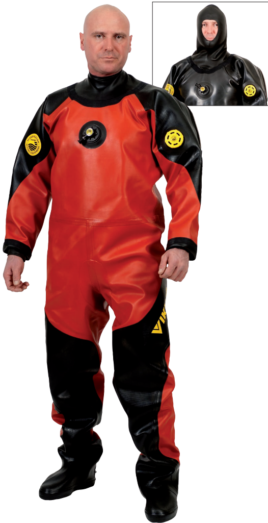
VIKING™ PRO with Surveyor latex neck seal (inset shows black suit with Surveyor latex hood).

The VIKING™ PRO is Ansell's biggest selling dry suit worldwide. Designed for flexibility and comfort in a wide range of applications. Vulcanised seams allow for peace of mind when diving under all situations.