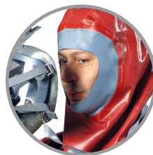
Anatomically designed face seal for optimum safety and comfort