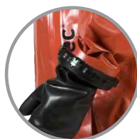
Bayonet glove ring system for quick and simple glove exchange