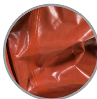
Strong and flexible suit material which offers maximum protection against aggressive chemicals in all forms