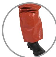
Attached boots or sewn-in socks in the suit material