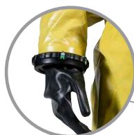
Bayonet glove ring system for quick and simple glove exchange