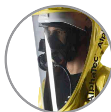
CV wide vision visor with 3D depth of 20 cm, giving extra side view. Alternatively larger VP1 visor