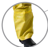
Attached boots or sewn-in socks in the suit material