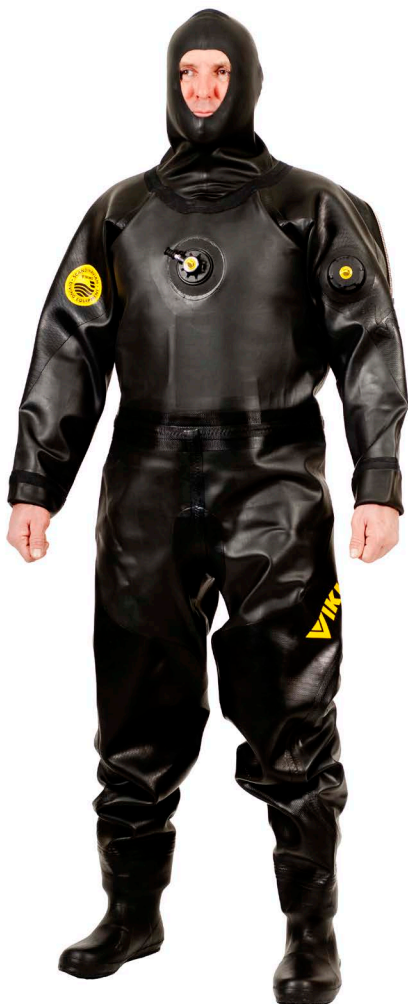
VIKING™ PROTECH II with Surveyor latex hood.

Flexible dry suit designed for maximum comfort in a wide range of applications, particularly suited to military use. Rear entry design. Vulcanised seams allow for peace of mind when diving under all situations.